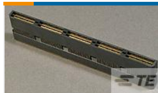
TE Part # 1-1658018-5 MSB0.80PL22ASY140DP,-,10,VCTY