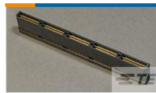
TE Part # 1-1658016-5 MSB0.80PL16ASY140DP,-,10,VCTY