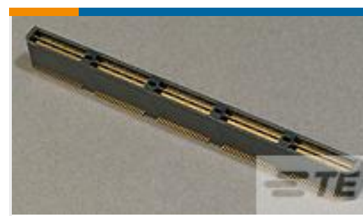
TE Part # 1-1658015-5 MSB0.80PL11ASY140DP,-,10,VCTY