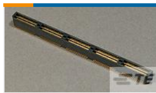
TE Part # 1-1658014-5 MSB0.80PL8ASY140DP,-,10,VCTY