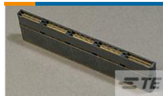
TE Part # 1-1658019-5 MSB0.80PL25ASY140DP,-,10,VCTY