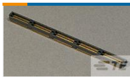
TE Part # 1-1658013-5 MSB0.80PL5ASY140DP,-,10,VCTY