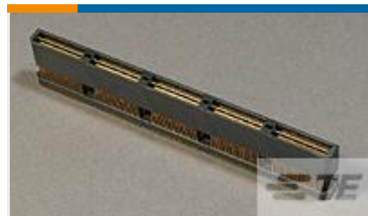
TE Part # 1-1658017-5 MSB0.80PL19ASY140DP,-,10,VCTY